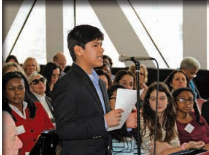
Above & below right: At our annual Children's Legislative Breakfast, presented in partnership with the Westchester Children's Association, Westchester youth had the opportunity to address legislators about issues facing young people.

We're all stakeholders when it comes to the future of Westchester's children. Our advocacy events and alerts keep the business and nonprofit communities, as well as parents, child care providers and elected officials, engaged and informed about the most pressing issues.