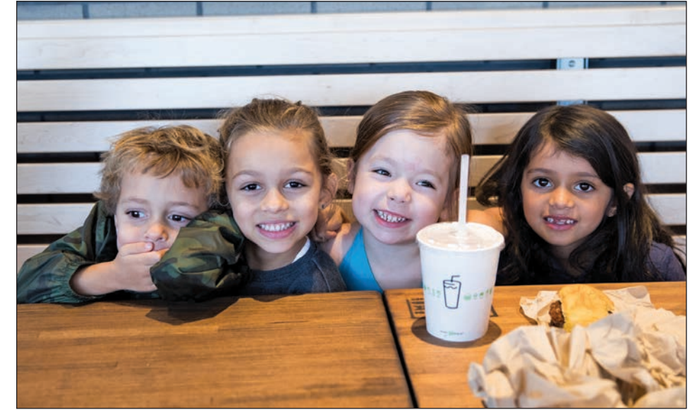
Our target audience enjoying a delicious Shake Shack lunch.

We received the profits from their recent soft opening - nearly $12,000 - the most EVER raised during a Shake Shack soft opening! And, we will continue to receive 5% of the sales from the delicious Pie Oh My Concrete dessert. We hope you'll visit Shake Shack regularly and thank them for being great neighbors! You can find them at 379 North Central Avenue, Hartsdale, NY 10530.