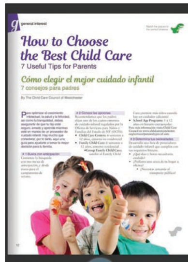
The September issue of Portal Magazine featured 7 tips to help parents choose the best child care, in English and Spanish.

Our referral specialists spend their days helping parents understand what quality care looks like and helping them find it and figure out how to afford it. But, we don't just wait for parents to call us! We're spreading the word through employers, in local publications, and at community events. All of our services for parents are free!