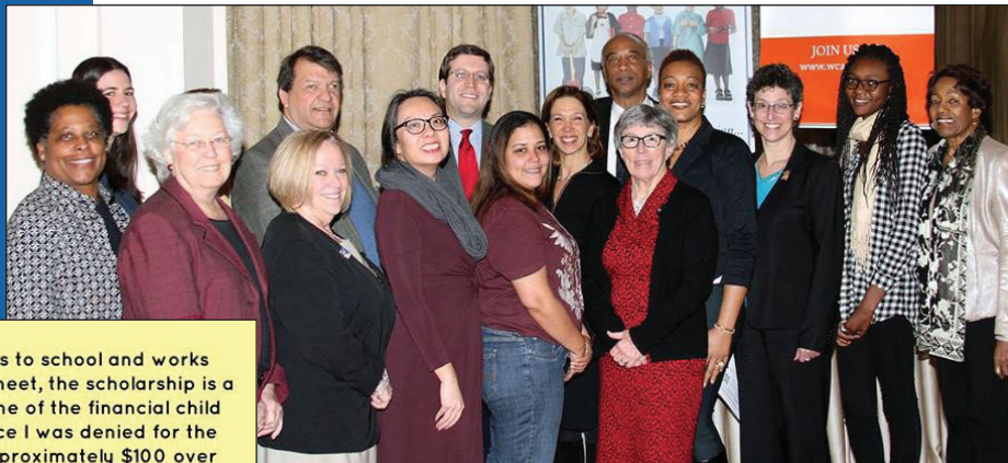
At the 2016 Legislative Breakfast on Children and Youth, presented in partnership with the Westchester Children's Association, Westchester's NYS elected officials participated in an interactive discussion regarding child care subsidies, raising the age of criminal responsibility, and early childhood home visiting.

A grant from the Westchester Community Foundation will fund new advocacy materials, a survey on child care impacts on local employers, and a workshop on advocacy skills for child care leaders, all of which will help us prepare for the 2017 budget season and beyond.