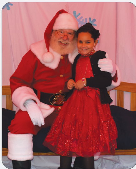
Santa returned to the Council in early December! About 30 families enjoyed hot cocoa and snacks, and got their picture taken. Part of our holiday toy drive to benefit Toys for Tots, many attendees brought a gift for a child in need.