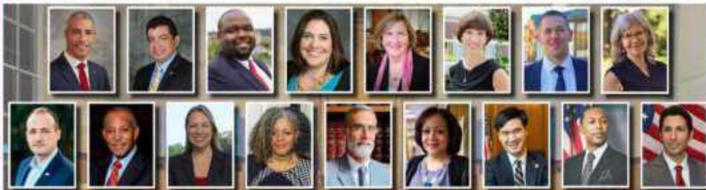
Westchester County Board of Legislators