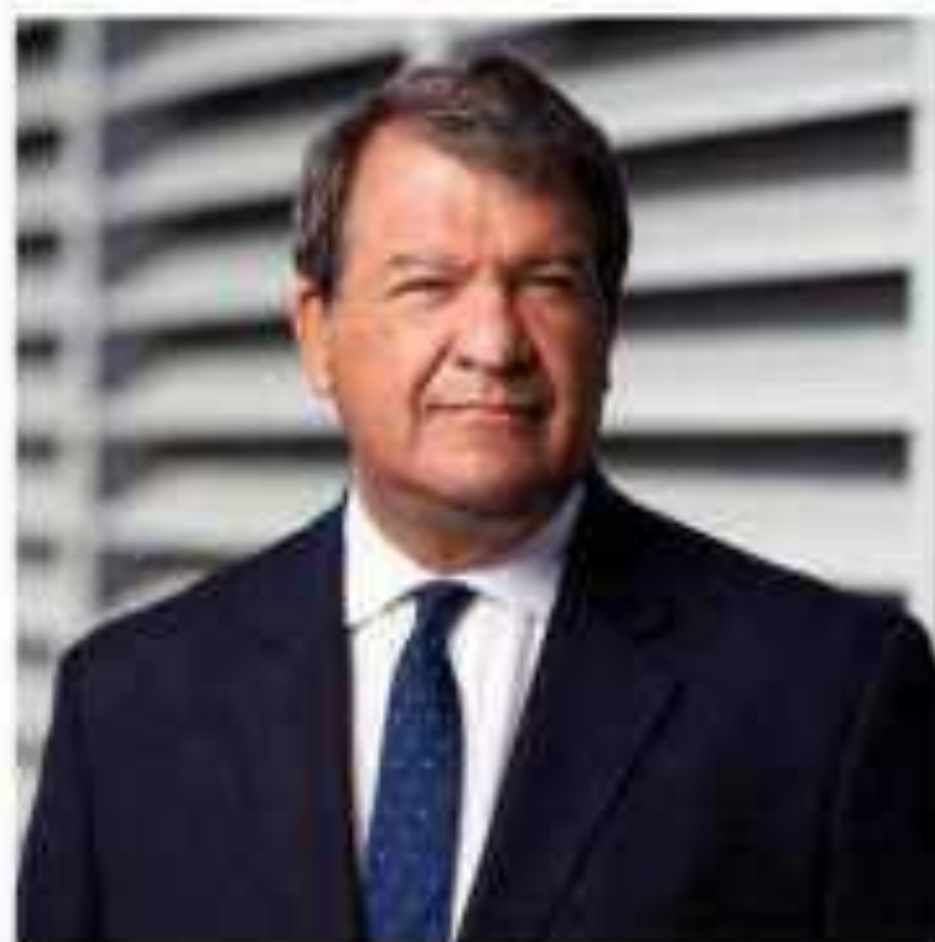
The Honorable George Latimer Westchester County Executive