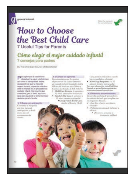
The September issue of Portal Magazine featured 7 tips to help parents choose the best child care, in English and Spanish.

Our referral specialists spend their days helping parents understand what quality care looks like and helping them find it and figure out how to afford it. But, we don't just wait for parents to call us! We're spreading the word through employers, in local publications, and at community events. All of our services for parents are free!