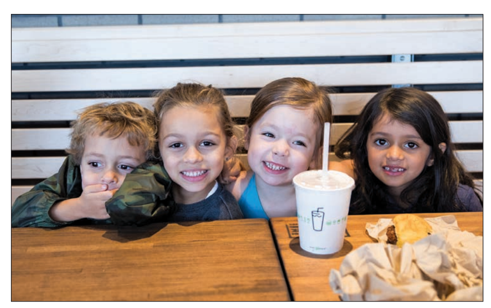
Our target audience enjoying a delicious Shake Shack lunch.

We received the profits from their recent soft opening – nearly $12,000 – the most EVER raised during a Shake Shack soft opening! And, we will continue to receive 5% of the sales from the delicious Pie Oh My Concrete dessert. We hope you'll visit Shake Shack regularly and thank them for being great neighbors! You can find them at 379 North Central Avenue, Hartsdale, NY 10530.